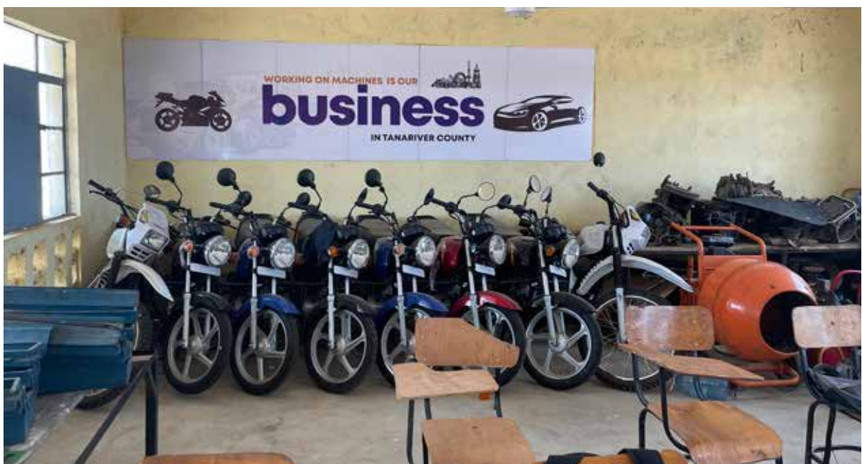
Boda (motorcycle repair)

Isiolo County benefitted from the P2P exchange by learning about Tana River’s intervention and observing the close collaboration between the County Government and Tana River youth. Tana River’s CEC-M walked the youth through the steps of setting up the YIEC, whereas obtaining political buy-in has and continues being more difficult in Isiolo. There has been little input from Isiolo’s government apart from contributing space for rent, while in Tana River’s case, the YIEC space is owned by the County. As a result, the process in Isiolo was largely participatory and youth-driven, with centre management careful to ensure representation from all wards (e.g., choosing topics of focus through coffee talks that ranged from education to corruption and elections). This meant that there was no strong legal framework for the establishment of the centre and its long-term sustainability. In the short- to medium-term, UNDP and volunteers stepped in to manage and run the centre, but this limits the extent to which the centre can expand its activities.