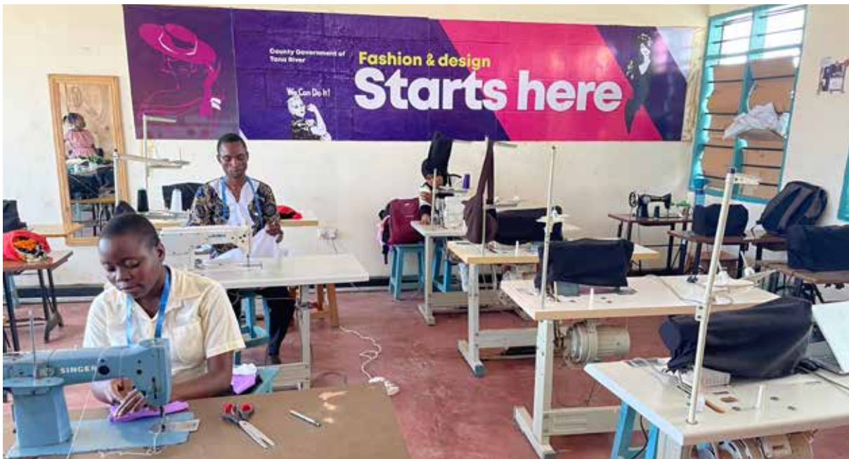
A sewing class in the centre

Tana River formulated a County Youth Inclusion Policy after representative consultations with youth from different wards, which gave them greater voice in running the YIEC and in other County affairs. The policy was formulated in partnership with the National Youth Council (NYC) and UNDP. Isiolo embarked on its youth policy process based on lessons learnt from Tana River, with County officials exchanging regular information and tacit knowledge on this topic. A WhatsApp group between the Counties was established and Isiolo developed a draft youth policy as a result.